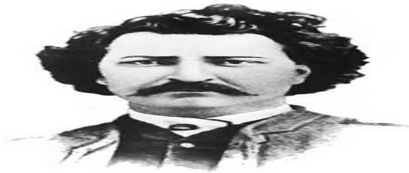
Louis Riel Day