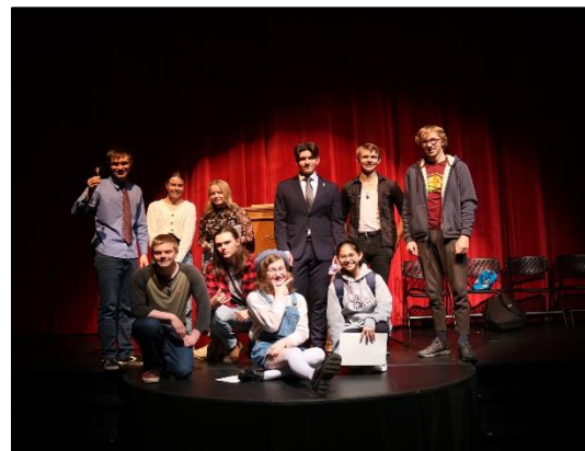
DCSS – South Peace Campus held elections for student council. The council has been eager to get underway and has already started planning for the next school year.