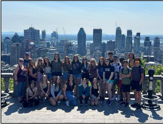
DCSS-Central Campus - The French Immersion Class is currently in Quebec immersing themselves in the French culture and practicing the French language.