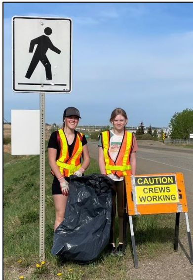
Many schools are participating in school and community clean-up events. The students are learning about giving back and land stewardship.