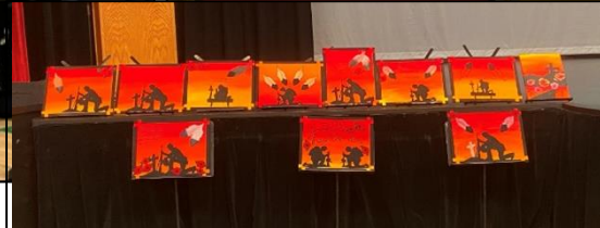
Gave Their All