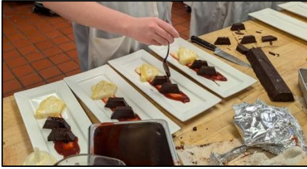
Tumbler Ridge Secondary Students enjoyed hands-on learning with the culinary program offered through Northern Lights College. These dishes look delicious!