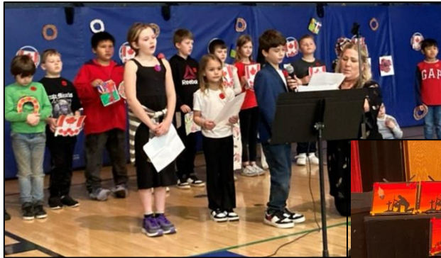
A Soldier's Life

Schools are privileged to host Remembrance Day assemblies to honour those who have served and those who continue to serve our country. This is a special and truly heartfelt occasion for students, staff, and family participation. Students engage in the assemblies by sharing stories, poems, artwork, and leading the moment of silence.